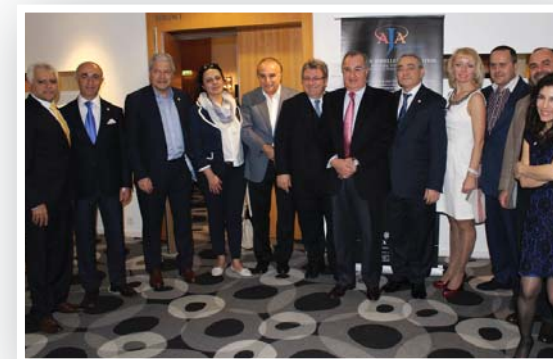
AJF Patrons at Baselworld 2014

38 of the Rose Gold and Stainless Steel series are being produced, each dedicated to one letter of the Armenian alphabet.